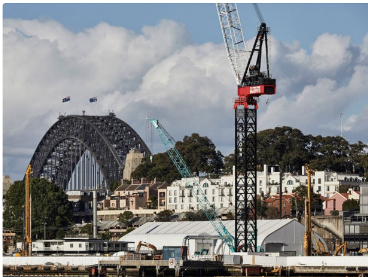
Marr Contracting is a heavy lifting tower crane specialist.

Impressed by The Men From Marr's track-record in designing and delivering large scale project lifting solutions on similarly challenging projects in Australia and around the world, DLSY Joint Venture challenged Marr Contracting International Ltd, (a wholly owned subsidiary of Marr Contracting Pty Ltd), to develop a solution that would decrease the construction time and associated risk for the project. The solution developed allowed the DLSY Joint Venture to adopt a refined construction methodology in line with their vision on how the project needed to be constructed.