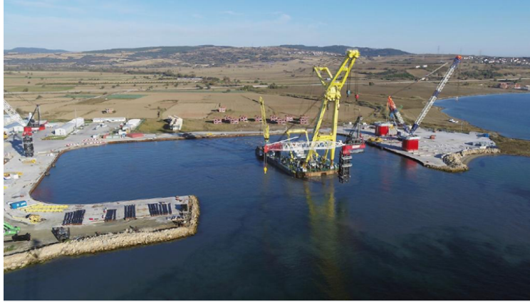
📷 Marr Contracting M2480D crane being lifted fully-assembled in record lift at Gallipoli.

“We’re particularly proud of the crange solution we came up with to assist in the construction of the 1915 Canakkale Bridge.